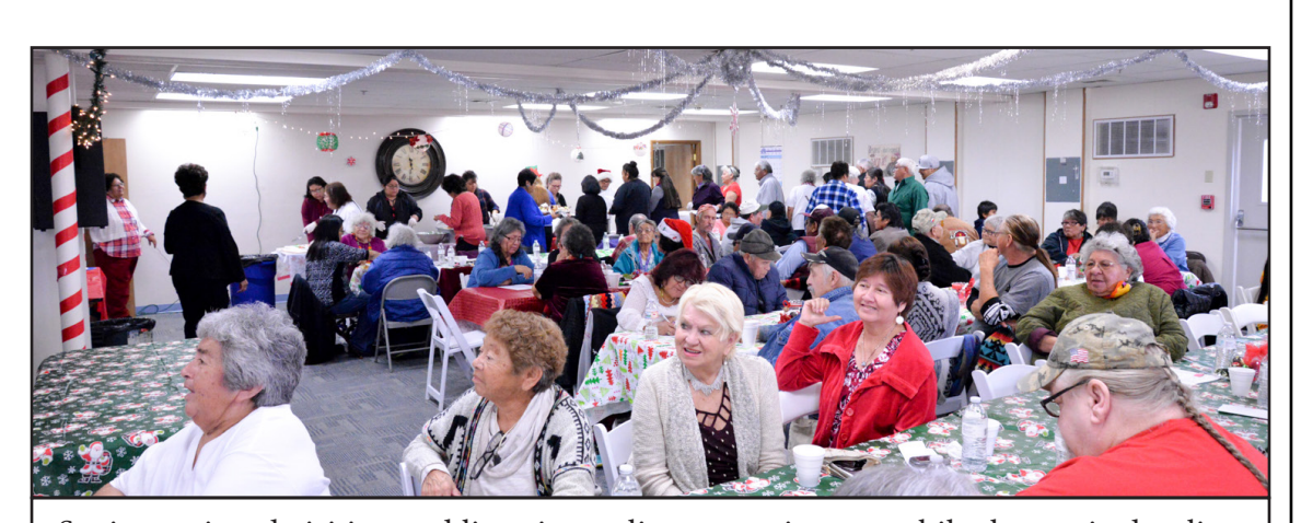
Seniors enjoyed visiting and listening to live entertainment while they waited to line up for lunch.

The seniors consumed lunch, visited and listened to the live entertainment.