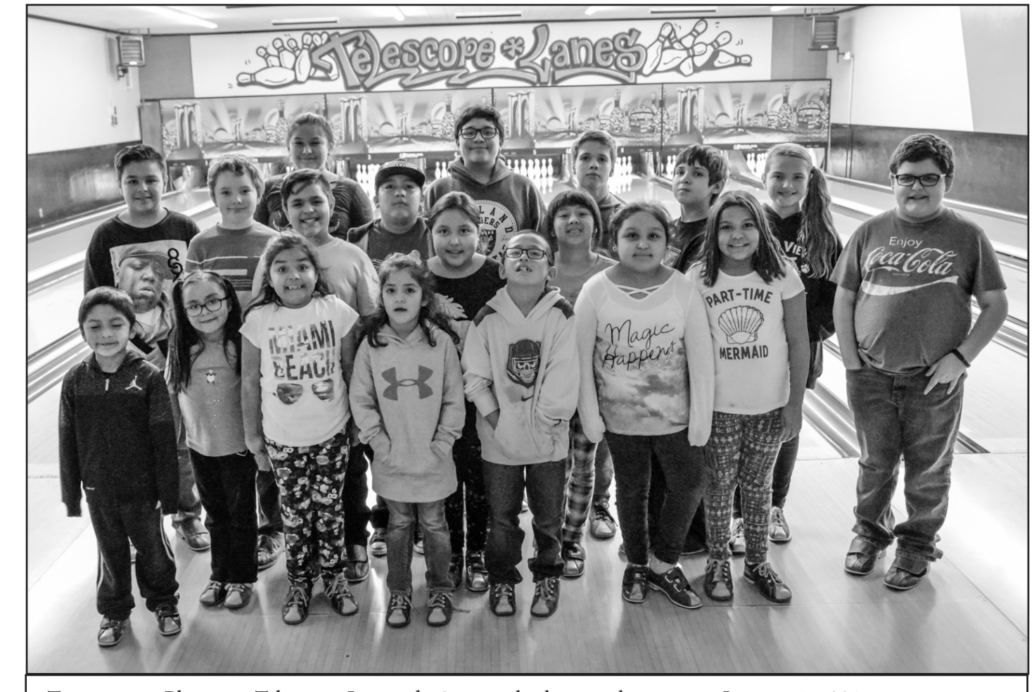
Tournament Players at Telescope Lanes, during regular league play.