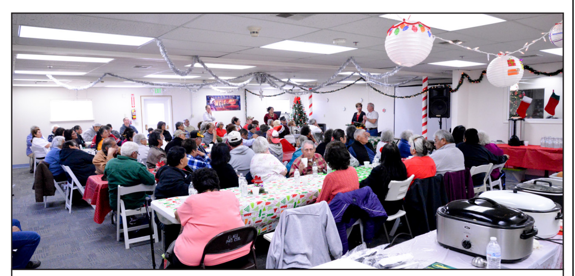
Seniors gathered at the Shoshone Welcome Center for their annual Christmas party. They listened to age appropriate presentations.

Elko, December 15 - Seniors gathered at the Shoshone Welcome Center to celebrate Christmas and the new year. The conference room was packed to watch a presentation provided by the Te-Moak Housing Authority staff and guests.